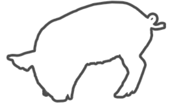
Loin of pork stuffed with alheira